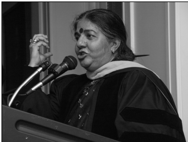
Shiva spoke passionately about her work and beliefs.

Her lecture, co-sponsored by the Department of Gender and Women’s Studies and the Goodwin-Niering Center’s Lambert Lecture Series, dealt with the issues of food security, and the importance of recognizing this as a very real global problem. She is particularly concerned with the prevalence of genetic modification of crops, and the impact this is having, not only in terms of the environment, but in terms of human health and the economy as well. She believes that the modification and subsequent patenting of crops by large corporations is having dire effects on farmers throughout the world, and is jeopardizing the health of the global population. She has dedicated her life to reversing this situation, and returning agriculture to its traditional roots. Food, she believes, is such an integral and essential part of all life that it must be given the utmost attention; genetic modification has so modified our crops as to leave them nearly void of nutritional value. This, coupled with monoculture (the practice of growing only a single species of crop rather than several within the same plot), has altered the face of agriculture. Farmers are forced into a position that leaves them reliant on pesticides and heavy irrigation, and suffering consistently low yields.