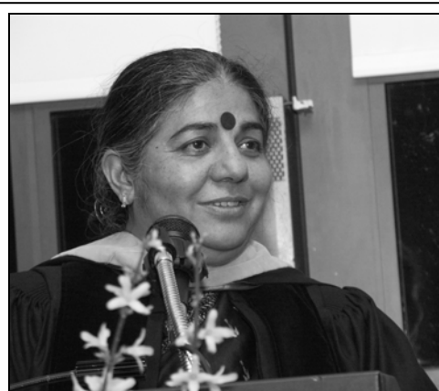
World-renowned activist and scholar Dr. Vandana Shiva visited the college on April 13 th and 14 th . Please see article and more pictures on page 10.

During the past fifteen years, acid deposition has been the focus of much political debate and scholarly research. Acid deposition is an environmental problem that crosses state and national boundaries, and is closely linked to energy policy since much of it originates as emissions from fossil-fuel power stations. The goals of this interdisciplinary conference were to summarize scientific and policy lessons learned from the attempt to control acid deposition, and to discuss the future of transboundary pollutants and market-based emission systems. The conference focused on important ecological impacts of acid deposition, the transboundary nature of the pollutants, and domestic and international policies designed to reduce their emission.