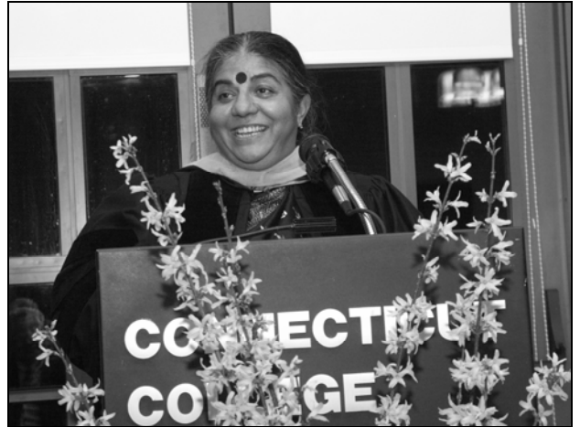
Dr. Vandana Shiva

Shiva calls for a return to traditional, organic methods of farming and gardening, and believes that in most cultures, this knowledge lies in women’s hands. The replacement of monoculture with mixed-crop gardens should significantly reduce the need for pesticides. In addition to health problems associated with pesticides, they are also petroleum-based, and thus further aggravate the current global oil issues. She believes the banning of genetic modification will allow plants to evolve and diversify, and protect themselves naturally. A shift to local or at least regional food sources will cut down both transportation and cost.